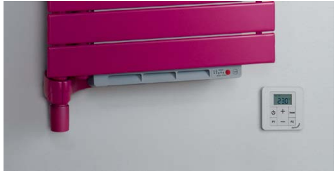
Electric heating fan with timer function and infrared control device